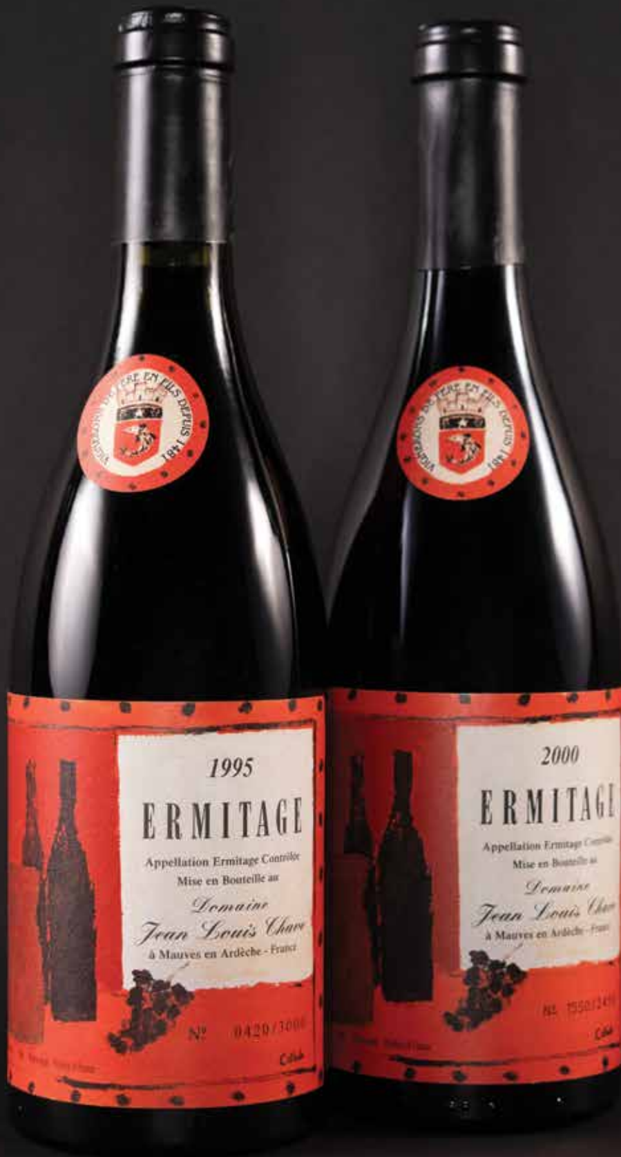
Lots 486 & 487