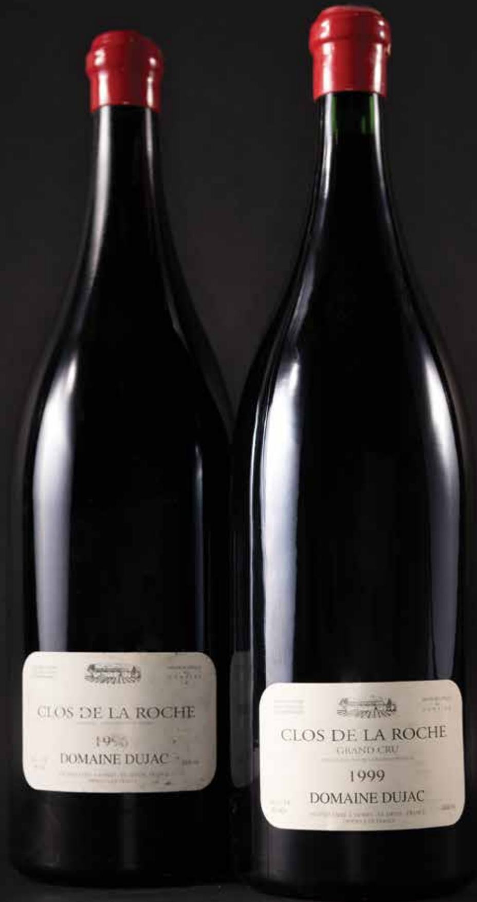
Lots 383 & 384