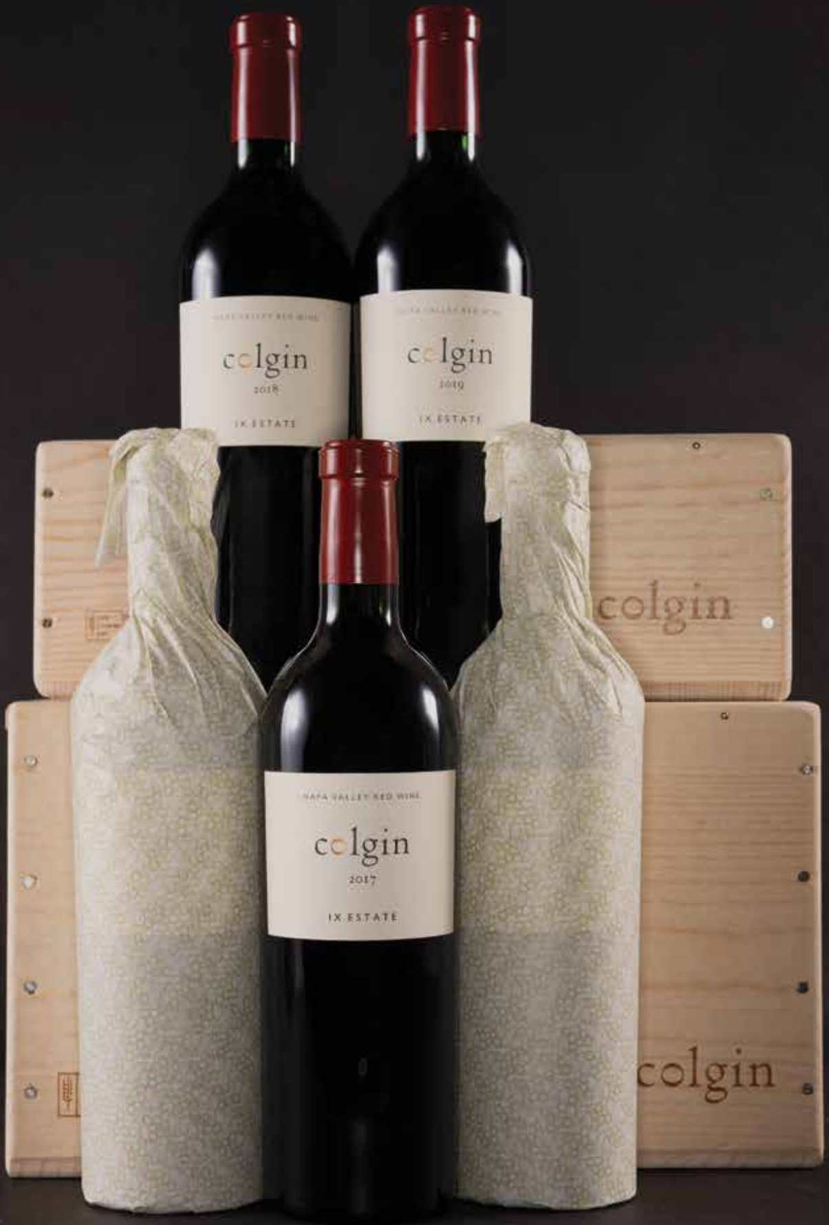
Lots 133, 135 & 138