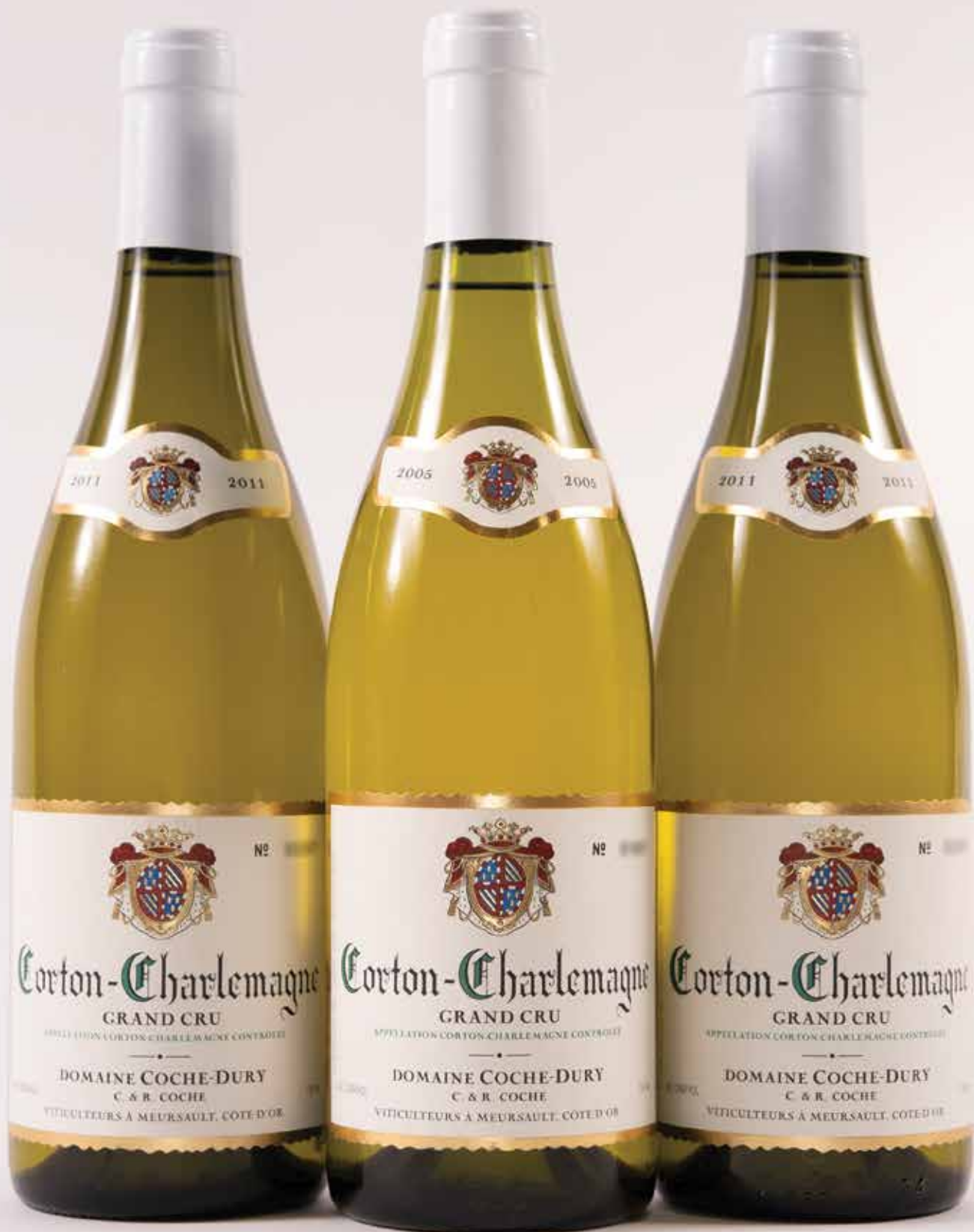
Lots 463 & 465